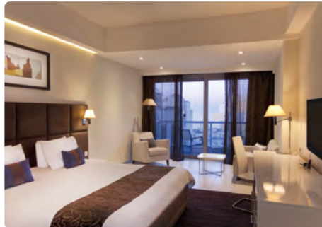
The George Hotel